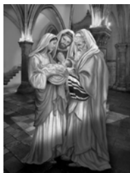
The Presentation of the Lord Tuesday, February, 2, 2016