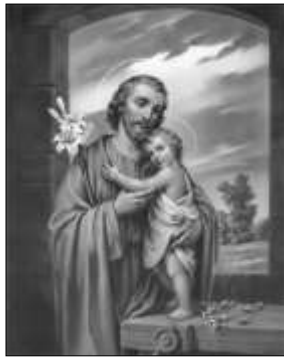
La Tavola Di San Giuseppe "The St. Joseph's Table"

St. Joseph is regarded by many Italians as their Patron Saint. In many Italian American communities, thanks are given to St. Joseph for his intercession in answering their prayers. The preparation of the Saint Joseph Table is an old Italian tradition which dates back to the Middle Ages. During that time, many parts of Italy were suffering from severe drought. The people prayed to St. Joseph asking for his intercession in ending the drought. They promised that, if he interceded, they would prepare a large feast to honor him. The rains did come and the people of Italy prepared a large banquet in his honor for all to share.