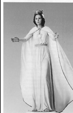
O Cuore Immacolato di Maria Rifugio delle Anime. Prega per noi.